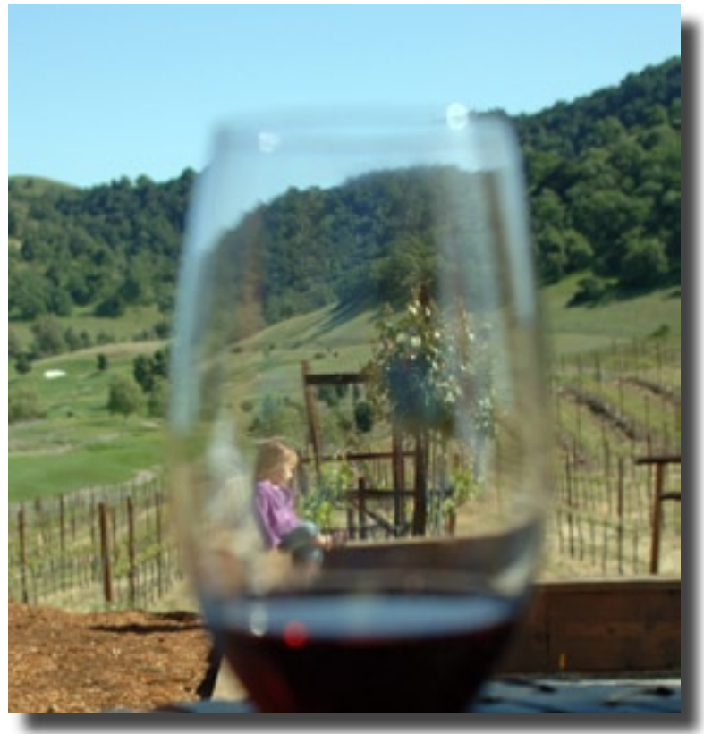
"Daydreaming" Clos LaChance Winery, San Martin, CA March 2007 Nikon 2DX

"This beautiful little girl was playing bocci ball with her family. She looked to be daydreaming, and I was daydreaming about wanting a little girl, while sipping my wine."